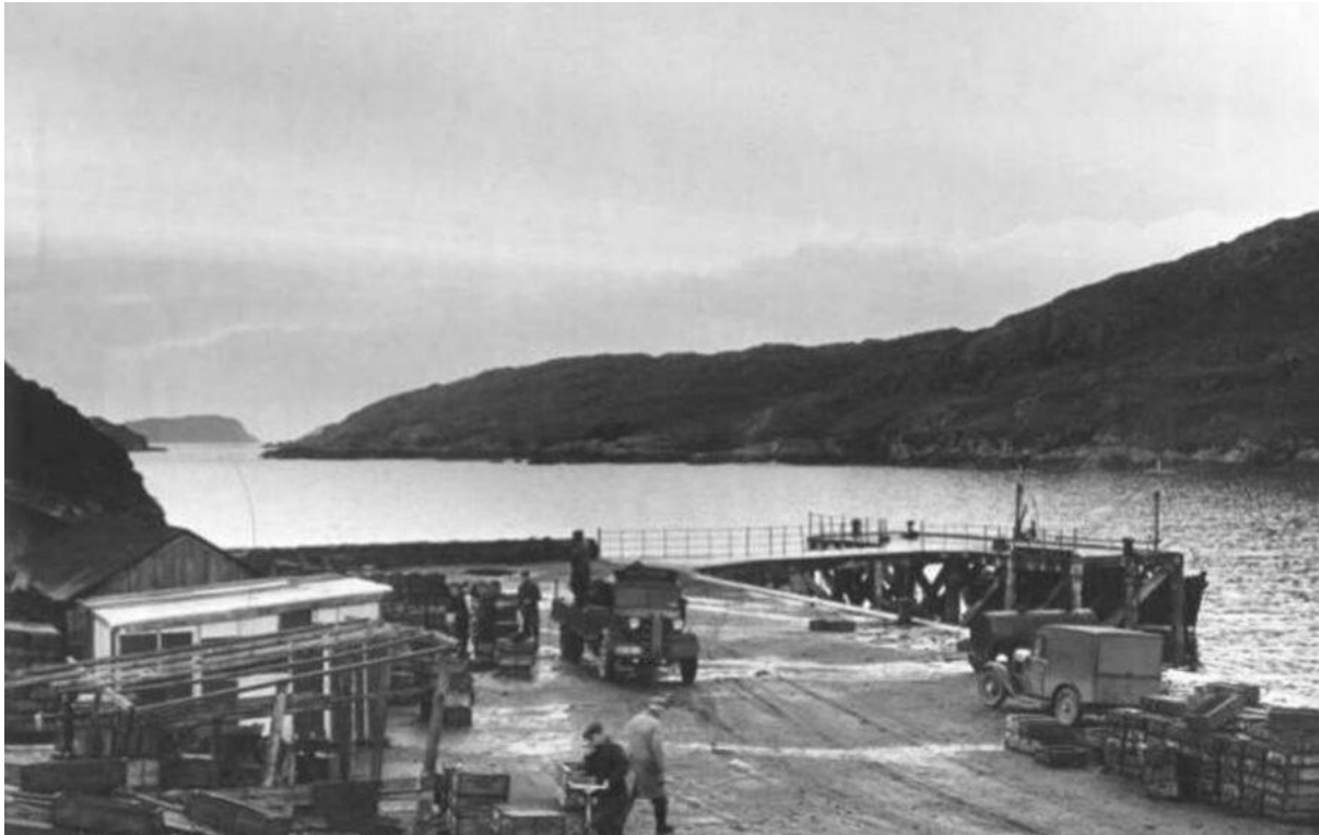
Loch Clash Pier, where fish sales took place in the 1940s.

Their previous project on Loch Clash transformed the historic fishing pier into a campervan stopover with fresh water, waste disposal and electricity.