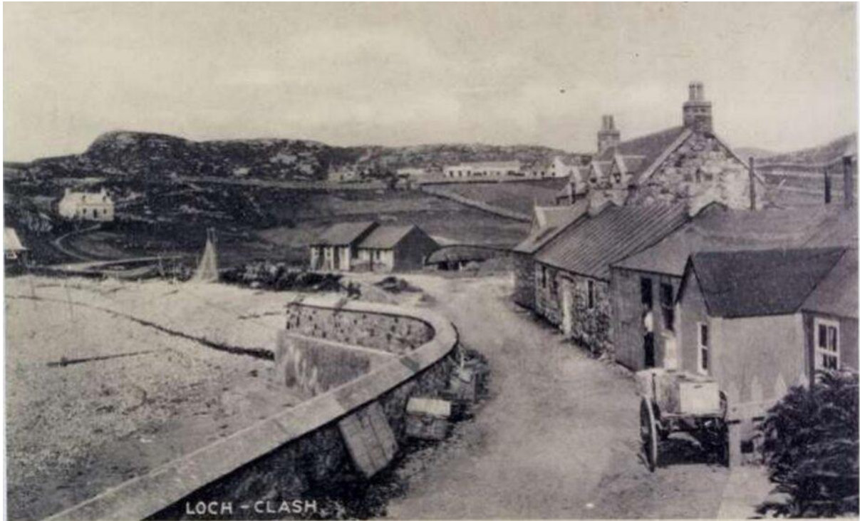
Loch Clash's harbour front in the early 20th Century.