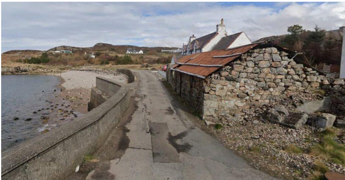
And in the modern day (2023). Derelict harbour store pictured.